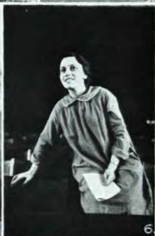
1. A test + A fire drill = 100%