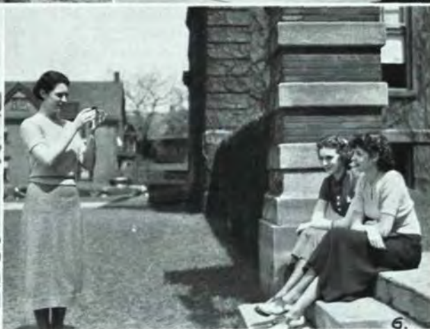
1. Flirtation Walk.