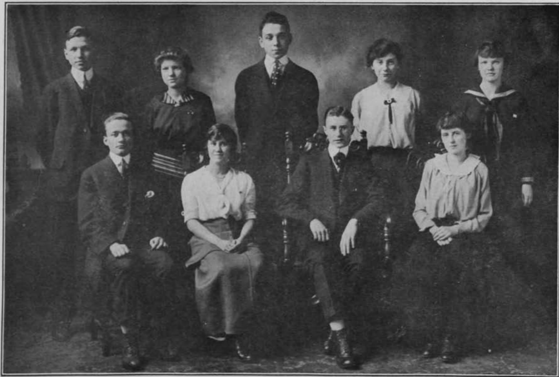
SENIOR CLASS BOOK BOARD