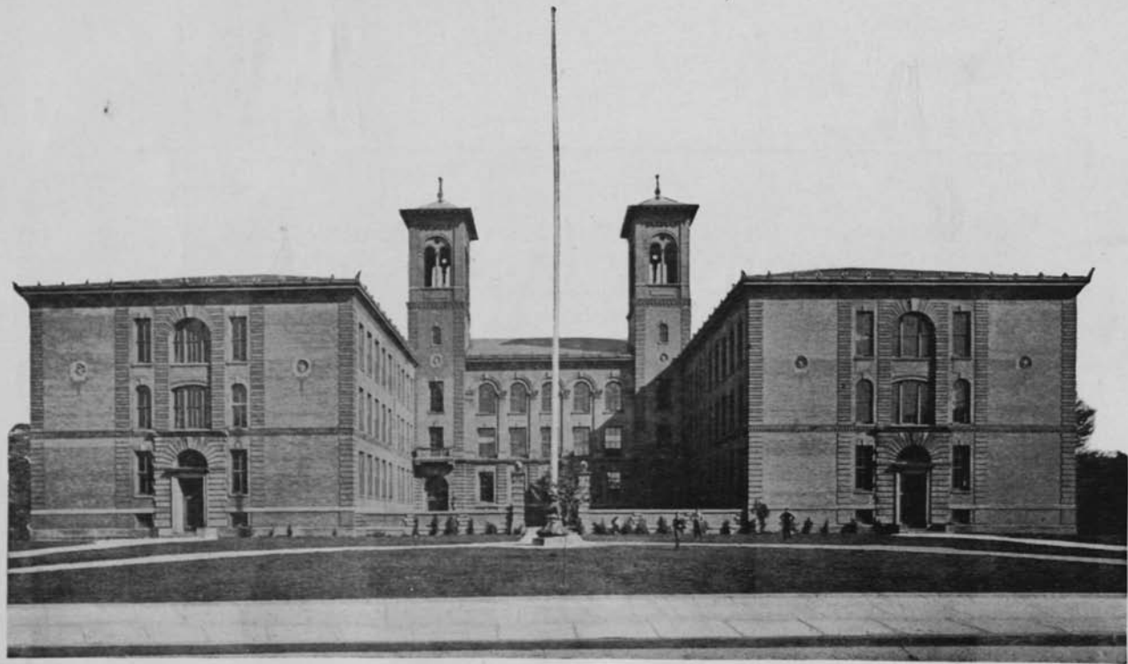
EAST HIGH SCHOOL