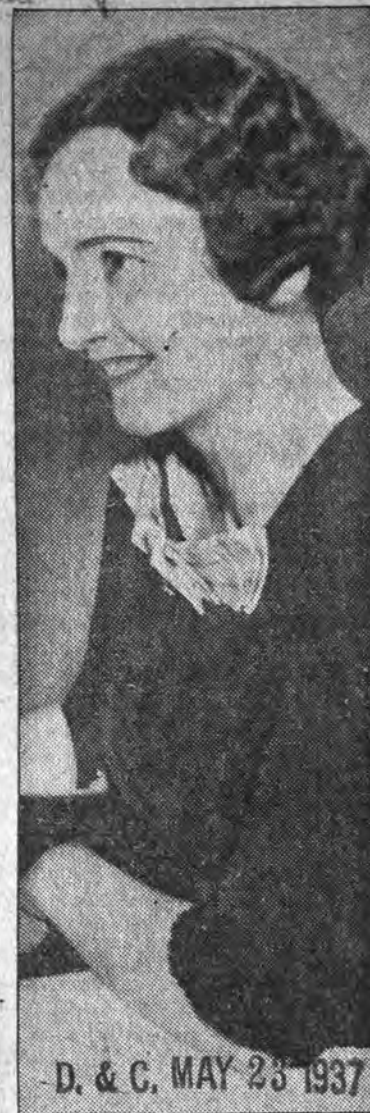
D. & C. MAY 23 1937

So today the privileged as well as the underprivileged child has the services of a visiting teacher of which there are 17 on the staff of the Board of Education. No longer is emphasis put on salvaging the pre-criminal, but of rounding out the whole child, regardless of privileges. The talented and the untalented child now receives individual attention.