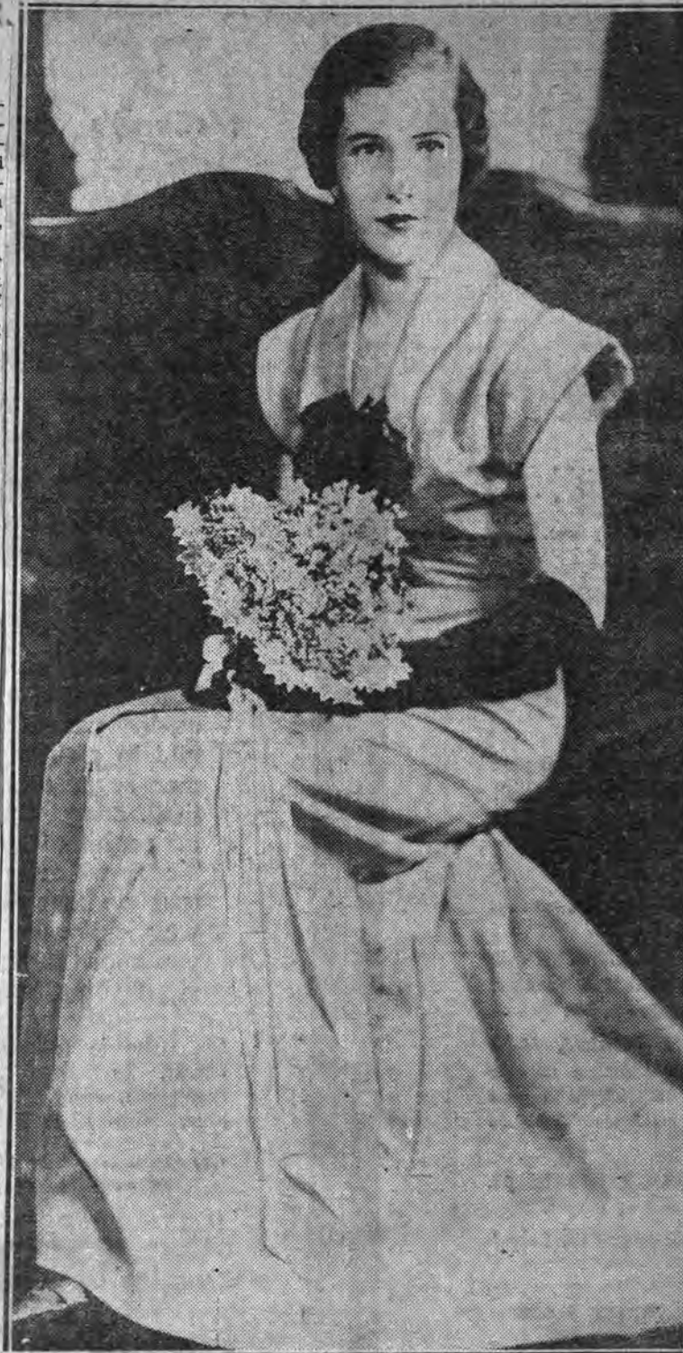
Miss Eleanor Roosevelt

Rochester Public Library 115 South Avenue