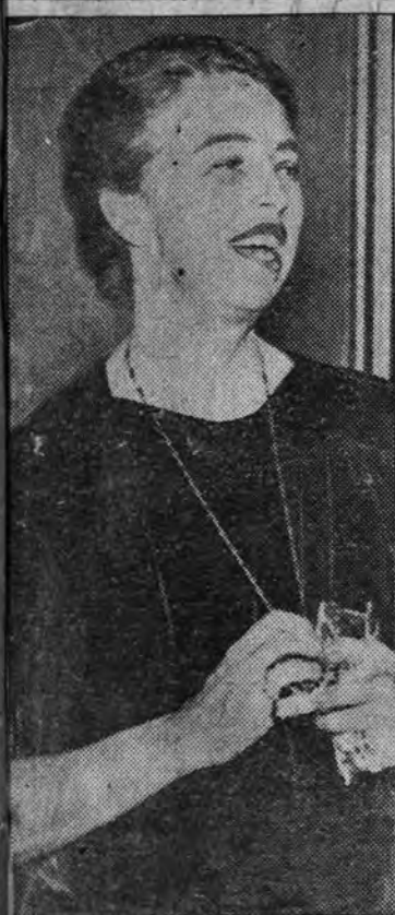
MRS. F. D. ROOSEVELT