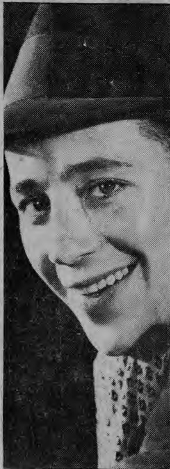
Ross Alexander, coming to the Century in "Flirtation Walk"

He was in the cast of "The Ladder." Given an important role in "Night Hostess," by Philip Dunne, George Abbott's partner, he was so seriously injured by an automobile in New York that he was in a hospital there for three months and missed the production.