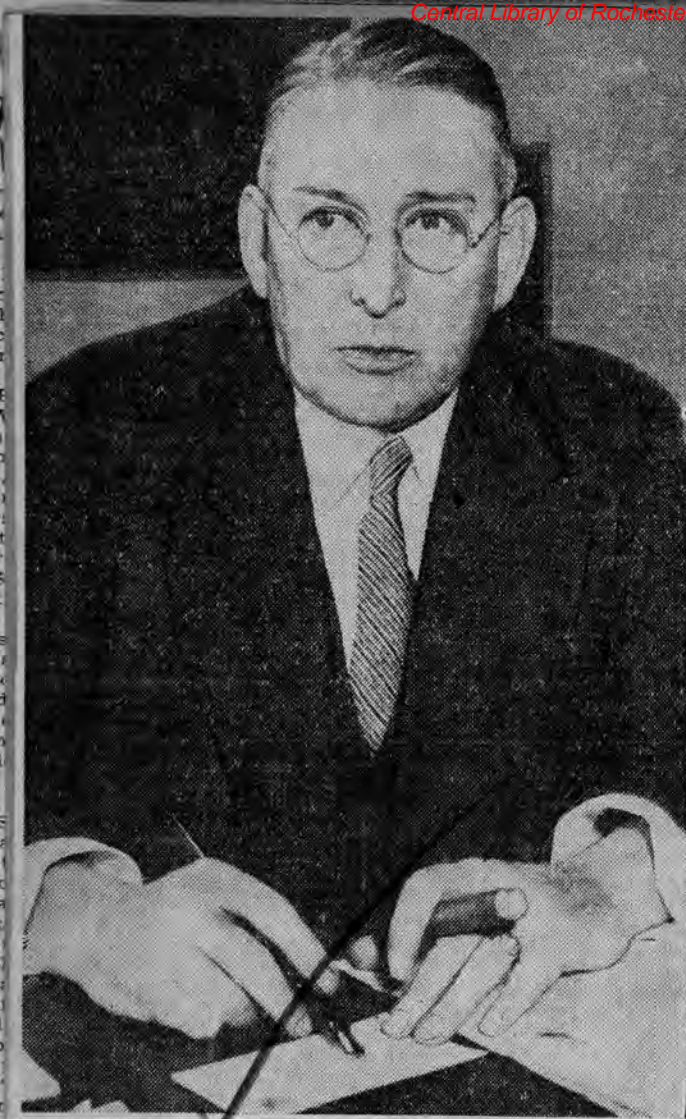
Public Library Court St.