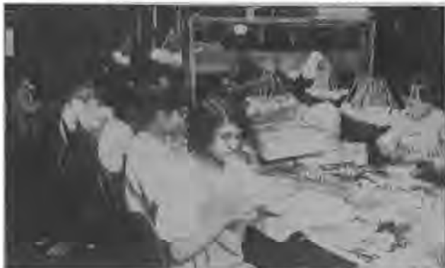
TYPES OF THE AMERICAN FACTORY GIRL

instances as we shall show they have parents and children dependent upon them and all the time the tragedy is deepened by the consciousness of youth and strength which cannot be employed, because they were made to work at such a speed when in the factory. We find that canning factories and others can and do take some of these women after the seasonal trades begin to reduce their force. "In no city" says the report, were more than 35% of the total force found on the pay-rolls fifty or more weeks in a year." Of the 2,544 tailoresses who reported as such at the 1900 census, 1,329 were motherless girls and 475 were fatherless, while of the whole number 2,158 were single, 180 of them having no breadwinner in the family. Of course all of these totals must be greater now. It is these last facts which make even the best figures on the payroll sound so insignificant.