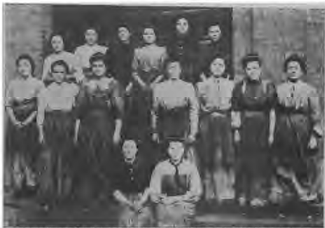
SEVENTY-ONE PER CENT OF ROCHESTER'S IMMIGRANT GIRLS ARE BREADWINNERS AND CAN DO VERY HEAVY WORK.

As to the comparative standing of Rochester in this matter we have been surprised to find how much worse off we are than many cities much larger. In population Rochester stands in the 25th rank but when it comes to making a list of the cities according to the percentage of breadwinners who are women boarding themselves we stand in the 10th rank. There are not as large a proportion of girls boarding themselves in the Bronx or Manhattan as in Rochester. We have in Rochester a larger percentage than even Pittsburg, Buffalo, Indianapolis, Providence, St. Louis, Baltimore, Cleveland and other cities of nearly equal size. We cannot wholly blame the clothing industry, for Baltimore is a large clothing center. Whatever inference we make we have a greater reason than most cities for looking out for our working girls without homes.