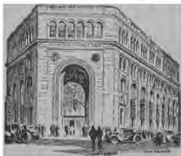
Franklin Street Office 40 FRANKLIN STREET