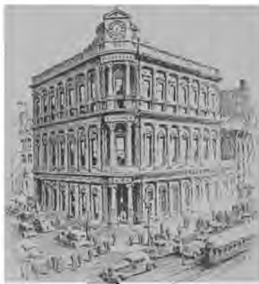
West Main Street Office 47 WEST MAIN ST.