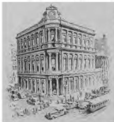
West Main Street Office 47 WEST MAIN ST.