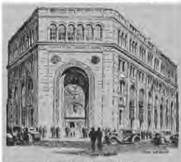
Franklin Street Office 40 FRANKLIN STREET