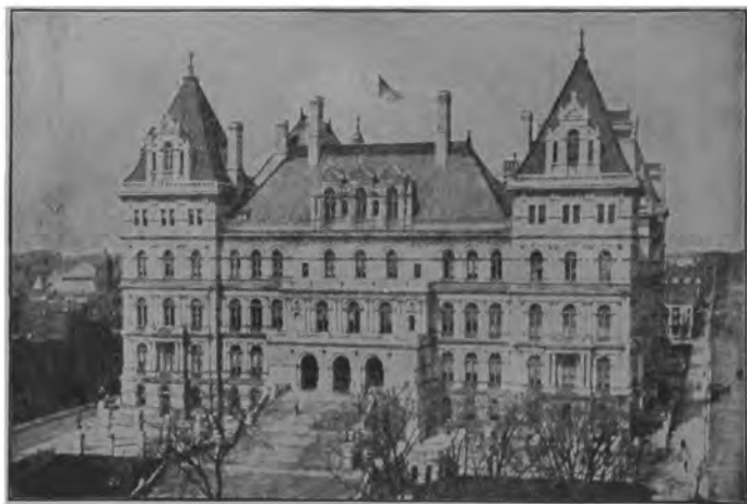
NEW YORK STATE CAPITOL ALBANY, N. Y.