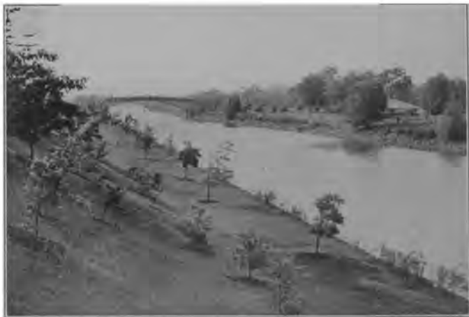
GENESEE VALLEY PARK