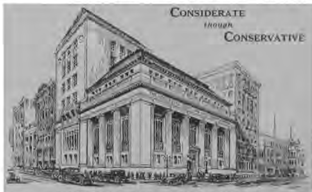
MAIN STREET WEST AND EXCHANGE

Rochester's First Trust Company—Operating under Perpetual Charter