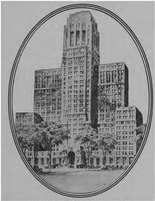
NEW YORK NEW STATE OFFICE BUILDING ALBANY, N. Y.