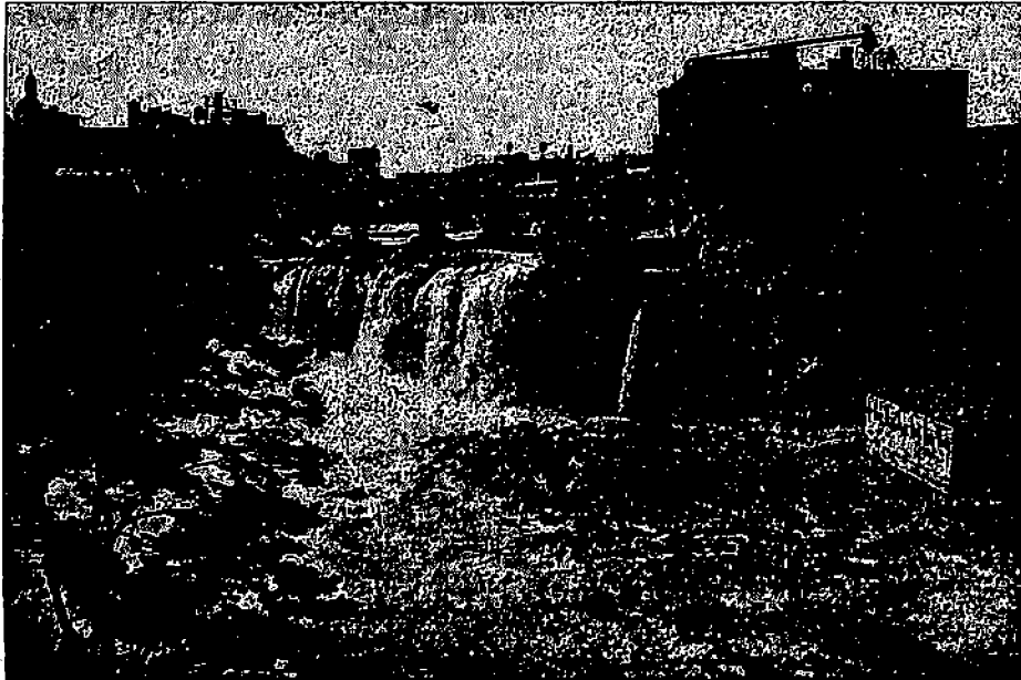
UPPER FALLS OF THE GENESEE RIVER ONE OF THE THREE FALLS IN THE HEART OF THE CITY

Flying Field: A first class airport, municipally owned and operated. 300 acres, including 3 modern hangars.