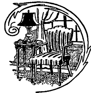
... Furniture of Quality - Traditional and Modern!

FURNITURE CARPETS — RUGS LINOLEUM GLASSWARE DINNERWARE RADIOS DRAPERIES BEDS — BEDDING KITCHEN EQUIPMENT ELECTRIC WASHERS REFRIGERATORS STOVES — RANGES TOYS — LAMPS NURSERY FURNITURE GIFT ITEMS EVERYTHING FOR THE HOME