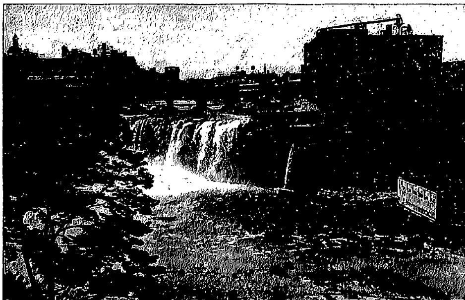
UPPER FALLS OF THE GENESSEE RIVER ONE OF THE THREE FALLS IN THE HEART OF THE CITY

Gas: A dependable supply of 537 B.T.U. manufactured gas. Electricity: Residential service is largely 60 cycle, alternating current. Various types of service are available to industrial and commercial establishments, depending on location and requirements. Steam: District steam for heating and industrial processes is provided from four stations. Railroads: 5, New York Central, Erie, Pennsylvania, Baltimore & Ohio and Lehigh Valley. Local Transportation: Bus. Subway: Owned by city, and crosses entire city for inter-urban, passenger and freight service. Bus Lines Entering City: 15. Other Services: Barge Canal Harbor and Warehouses in Center of City. Port of Rochester on Lake Ontario, 7 miles from City Center with Municipal Docks. Daily Ferry Service to Canada. Day and Night Boat Service to Canada and Thousand Islands, Seasonal. Flying Field: A first class airport, municipally owned and operated. 300 acres, including 3 modern hangars.