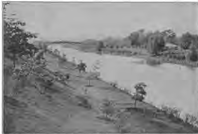
GENESEE VALLEY PARK

From 1923 to 1927 Rochester industries showed the greatest per cent increase in the number of employees, stood second in the growth of wages paid, and rated third in the percent growth realized in manufacturing output, as compared with thirty leading American cities.