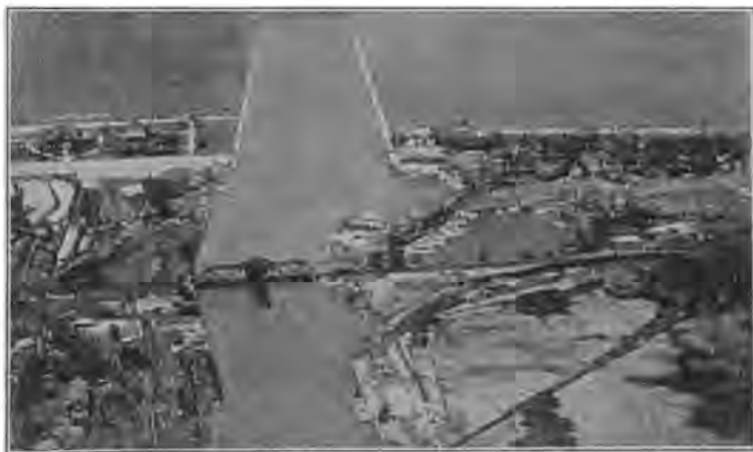
PORT OF ROCHESTER—ON LAKE ONTARIO

In the years since its incorporation as a city in 1834, Rochester has enjoyed a remarkably uninterrupted growth. When the opening of the west resulted in the removal of the milling interests from the city, the enterprise of its citizens resulted in the establishment of other lines of industry.