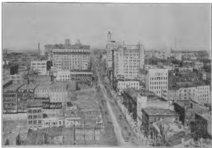
PART OF BUSINESS SECTION, LOOKING EAST ON MAIN STREET

devices and office systems; the largest thermometer plant in the world; the largest optical works in the world; the largest manufacturers of check protectors; the largest film factory in the world; the largest camera factory in the world; the largest photographic plate factory in the world; the largest manufacturers of soda fountain fruits and syrups. It is a leader in telephone apparatus, paper box manufacturers and many other lines. More high-class ivory buttons are made here than in any city in the United States. It is the headquarters of the nursery business of the United States.