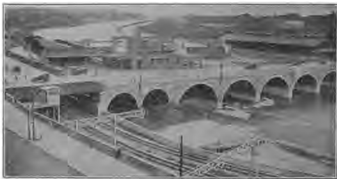
COURT STREET BRIDGE, SUBWAY AND BARGE CANAL HARBOR

In its new subway, Rochester has all the advantages of a highly modern joint transit railroad facility. This important traffic artery operated by electricity, provides expedited passenger and freight service for a large portion of the city, at a cost of more than $12,000,000. Rochester has utilized the right of way of the old Erie Canal, passing east and west through the very center of the city, which has been abandoned in favor of the New Barge Canal, south of the city.