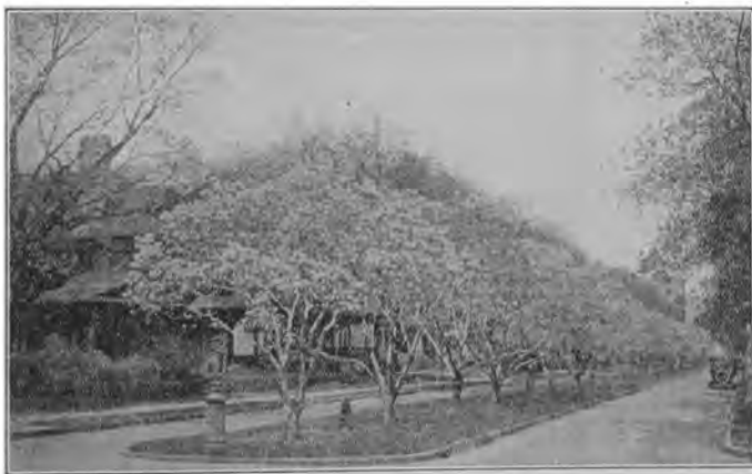
MAGNOLIA TIME—OXFORD STREET

museum, with a classroom for educational work with children, and a Little Theatre with a seating capacity of 300 persons.