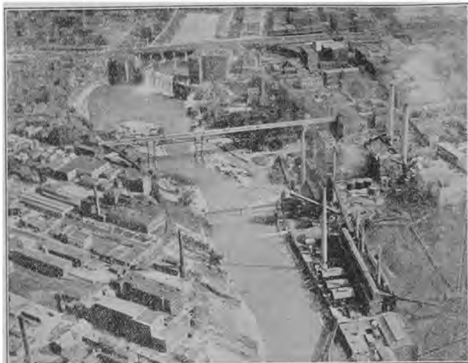
PART OF INDUSTRIAL ROCHESTER

Known first as the Flour City because of its extensive milling interests, the city's cognomen was later changed to the Flower City because of the extensive horticultural interests which were developed. With the growth of industry on a large scale, the city became known as the city of varied industries and took as its slogan "Rochester Made Means Quality." Rochester boasts many famous industrial organizations and leads the world in the production of a number of products.