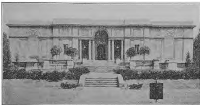
MEMORIAL ART GALLERY

Connected with the University is the Memorial Art Gallery, which offers facilities for college work in art, as well as for public exhibitions. The gallery embraces a children's