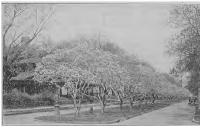
MAGNOLIA TIME—OXFORD STREET

museum, with a classroom for educational work with children, and a Little Theatre with a seating capacity of 300 persons.