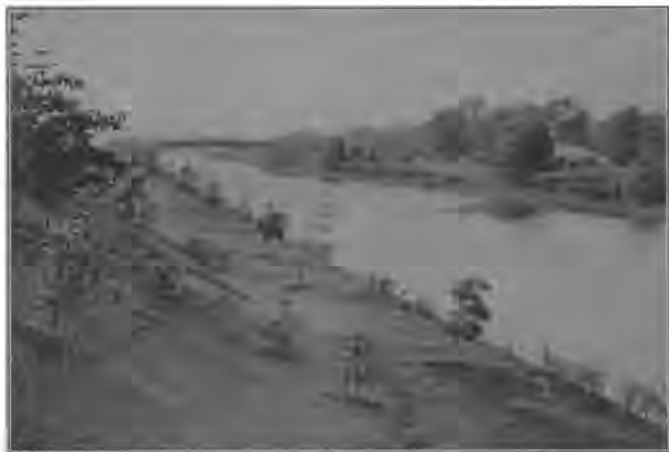
GENESEE VALLEY PARK

From 1923 to 1927 Rochester industries showed the greatest per cent increase in the number of employees, stood second in the growth of wages paid, and rated third in the percent growth realized in manufacturing output, as compared with thirty leading American cities.