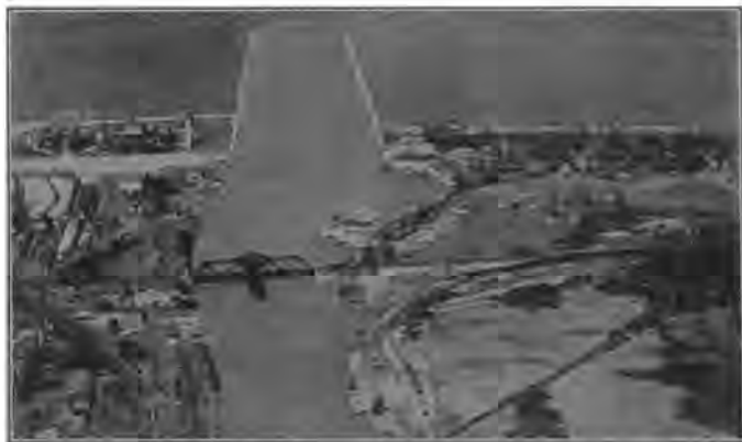
PORT OF ROCHESTER—ON LAKE_ONTARIO

In the years since its incorporation as a city in 1834, Rochester has enjoyed a remarkably uninterrupted growth. When the opening of the west resulted in the removal of the milling interests from the city, the enterprise of its citizens resulted in the establishment of other lines of industry.