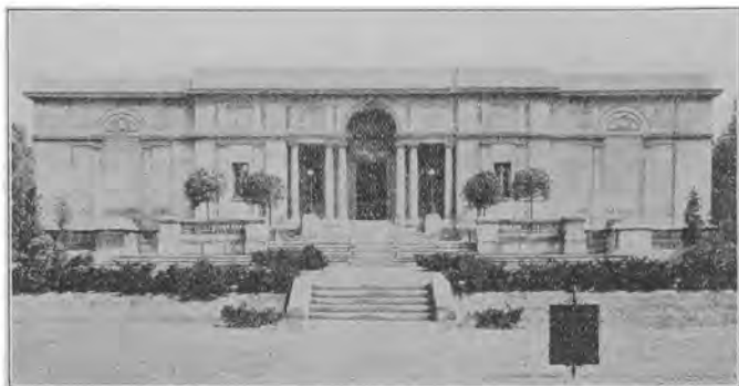
MEMORIAL ART GALLERY

Connected with the University is the Memorial Art Gallery, which offers facilities for college work in art, as well as for public exhibitions. The gallery embraces a children's