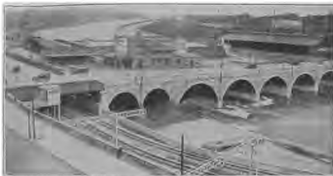
COURT STREET BRIDGE, SUBWAY AND BARGE CANAL HARBOR

In its new subway, Rochester has all the advantages of a highly modern joint transit railroad facility. This important traffic artery operated by electricity, provides expedited passenger and freight service for a large portion of the city, at a cost of more than $12,000,000. Rochester has utilized the right of way of the old Erie Canal, passing east and west through the very center of the city, which has been abandoned in favor of the New Barge Canal, south of the city.