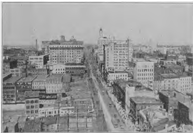
PART OF BUSINESS SECTION, LOOKING EAST ON MAIN STREET

devices and office systems; the largest thermometer plant in the world; the largest optical works in the world; the largest manufacturers of check protectors; the largest film factory in the world; the largest camera factory in the world; the largest photographic plate factory in the world; the largest manufacturers of soda fountain fruits and syrups. It as a leader in telephone apparatus, paper box manufacturers and many other lines. More high-class ivory buttons are made here than in any city in the United States. It is the headquarters of the nursery business of the United States.