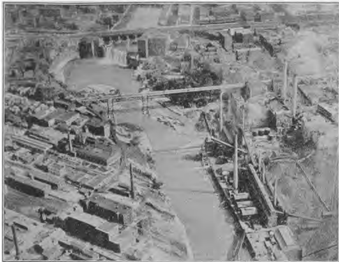
PART OF INDUSTRIAL ROCHESTER

Known first as the Flour City because of its extensive milling interests, the city's cognomen was later changed to the Flower City because of the extensive horticultural interests which were developed. With the growth of industry on a large scale, the city became known as the city of varied industries and took as its slogan "Rochester Made Means Quality." Rochester boasts many famous industrial organizations and leads the world in the production of a number of products.