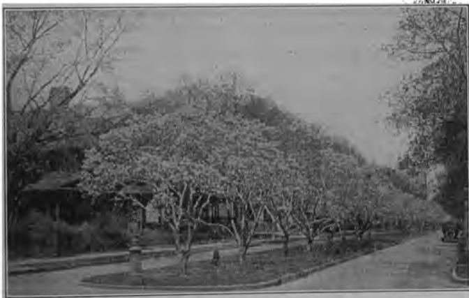
MAGNOLIA TIME—OXFORD STREET

museum, with a classroom for educational work with children, and a Little Theatre with a seating capacity of 300 persons.