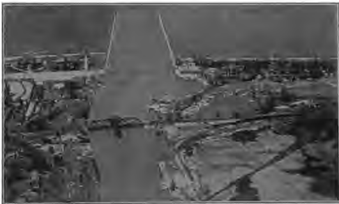
PORT OF ROCHESTER—ON LAKE ONTARIO

In the ninety-five years since its incorporation as a city in 1834, Rochester has enjoyed a remarkably uninterrupted growth. When the opening of the west resulted in the removal of the milling interests from the city, the enterprise of its citizens resulted in the establishment of other lines of industry.