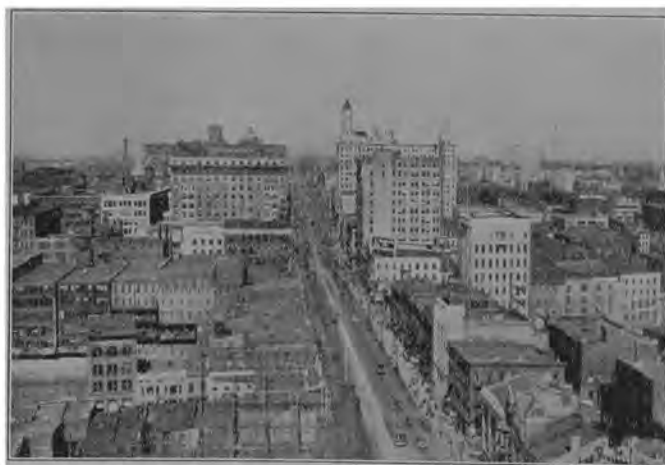
PART OF BUSINESS SECTION, LOOKING EAST ON MAIN STREET

devices and office systems; the largest thermometer plant in the world; the largest optical works in the world; the largest manufacturers of check protectors; the largest film factory in the world; the largest camera factory in the world; the largest photographic plate factory in the world; the largest manufacturers of soda fountain fruits and syrups. It is a leader in telephone apparatus, paper box manufacturers and many other lines. More high-class ivory buttons are made here than in any city in the United States. It is the headquarters of the nursery business of the United States.