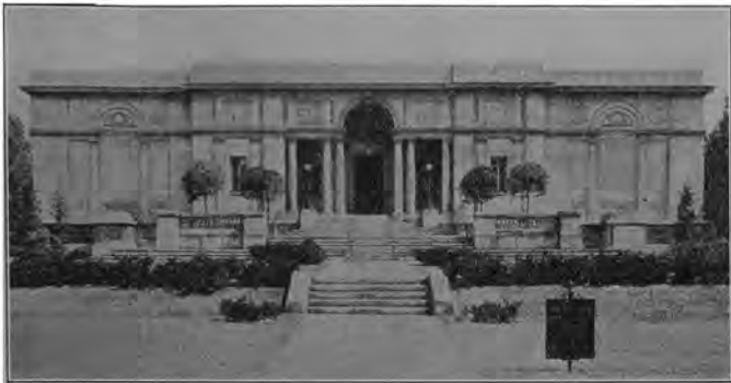
MEMORIAL ART GALLERY

Connected with the University is the Memorial Art Gallery, which offers facilities for college work in art, as well as for public exhibitions. The gallery embraces a children's