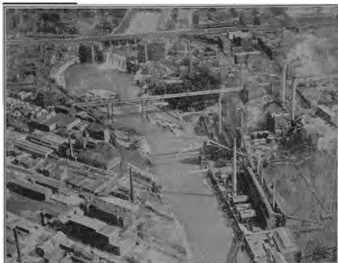
PART OF INDUSTRIAL ROCHESTER

Known first as the Flour City because of its extensive milling interests, the city's cognomen was later changed to the Flower City because of the extensive horticultural interests which were developed. With the growth of industry on a large scale, the city became known as the city of varied industries and took as its slogan "Rochester Made Means Quality." Rochester boasts many famous industrial organizations and leads the world in the production of a number of products.