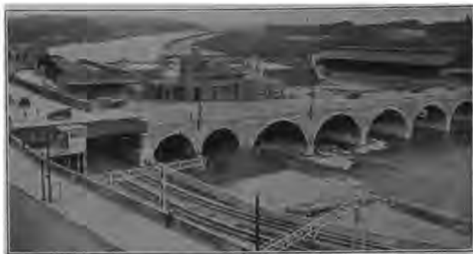
COURT STREET BRIDGE, SUBWAY AND BARGE CANAL HARBOR

In its new subway, Rochester has all the advantages of a highly modern joint transit railroad facility. This important traffic artery operated by electricity, provides expedited passenger and freight service for a large portion of the city, at a cost of more than $12,000,000. Rochester has utilized the right of way of the old Erie Canal, passing east and west through the very center of the city, which has been abandoned in favor of the New Barge Canal, south of the city.