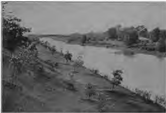
GENESEE VALLEY PARK

From 1923 to 1927 Rochester industries showed the greatest per cent increase in the number of employees, stood second in the growth of wages paid, and rated third in the percent growth realized in manufacturing output, as compared with thirty leading American cities.