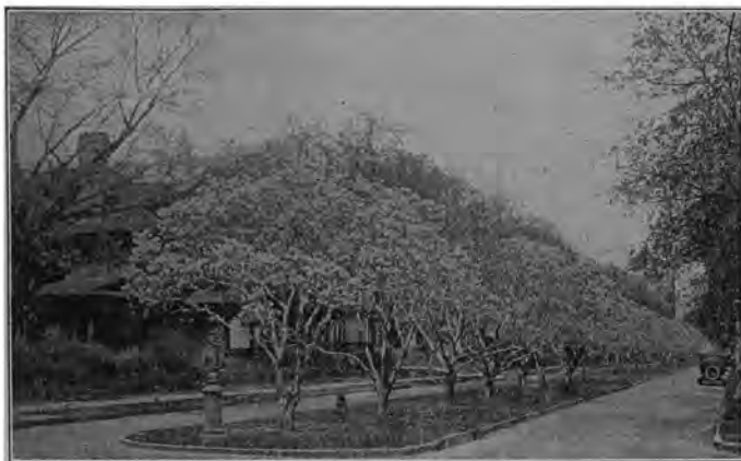
MAGNOLIA TIME—OXFORD STREET

Rochester has two lake-shore city-owned bathing beaches, embracing over a mile of lake front, together with two out-door pools and two indoor pools. Bath houses are also maintained in convenient sections of the city.