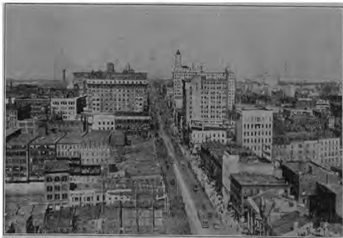
PART OF BUSINESS SECTION, LOOKING EAST ON MAIN STREET

filming devices and office systems; the largest thermometer plant in the world; the largest optical works in the world; the largest manufacturers of check protectors; the largest film factory in the world; the largest camera factory in the world; the largest photographic plate factory in the world; the largest manufacturers of soda fountain fruits and syrups. It is a leader in telephone apparatus, paper box manufacture and many other lines. More high-class ivory buttons are made here than in any city in the United States. It is the headquarters of the nursery business of the United States.