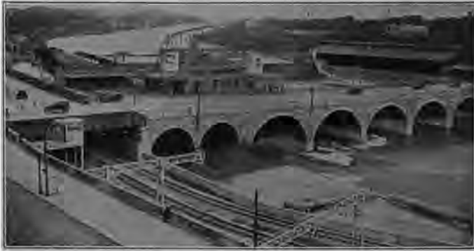
COURT STREET BRIDGE, SUBWAY AND BARGE CANAL HARBOR

In its new subway, Rochester has all the advantages of a highly modern joint transit railroad facility. This important traffic artery operated by electricity, provides expedited passenger and freight service for a large portion of the city, at a cost of more than $12,000,000. Rochester has utilized the right of way of the old Erie Canal, passing east and west through the very center of the city, which has been abandoned in favor of the New Barge Canal, south of the city.