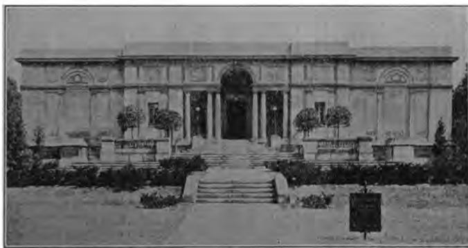
MEMORIAL ART GALLERY

In 1931, the Public Library Department spent approximately $343,144 for maintenance and upkeep.