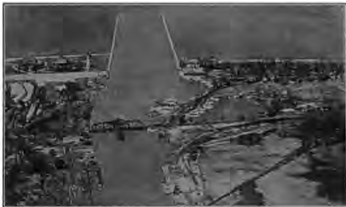
PORT OF ROCHESTER—ON LAKE ONTARIO

In the ninety-five years since its incorporation as a city in 1834, Rochester has enjoyed a remarkably uninterrupted growth. When the opening of the west resulted in the removal of the milling interests from the city, the enterprise of its citizens resulted in the establishment of other lines of industry.