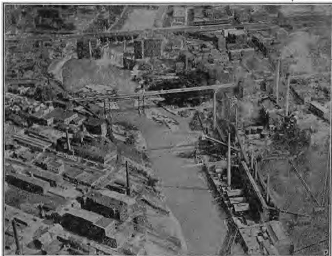
PART OF INDUSTRIAL ROCHESTER

Known first as the Flour City because of its extensive milling interests, the city's cognomen was later changed to the Flower City because of the extensive horticultural interests which were developed. With the growth of industry on a large scale, the city became known as the city of varied industries and took as its slogan "Rochester Made Means Quality." Rochester boasts many famous industrial organizations and leads the world in the production of a number of products.