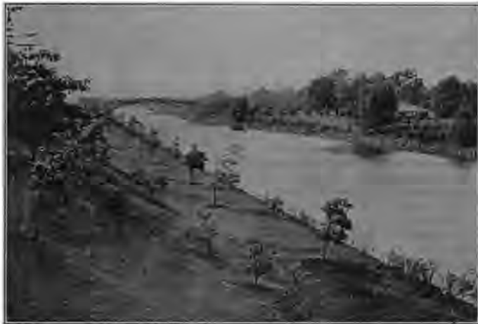
GENESEE VALLEY PARK

From 1923 to 1927 Rochester industries showed the greatest per cent. increase in the number of employees, stood second in the growth of wages paid, and rated third in the percent growth realized in manufacturing output, as compared with thirty leading American cities.