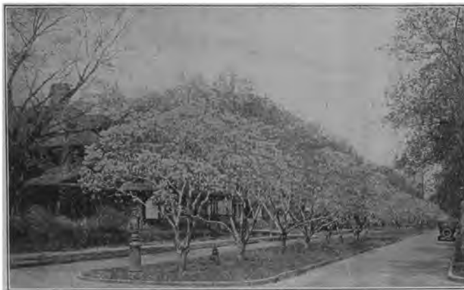
MAGNOLIA TIME—OXFORD STREET

Rochester has two lake-shore city-owned bathing beaches, embracing over a mile of lake front, together with two outdoor pools and two indoor pools. Bath houses are also maintained in convenient sections of the city.