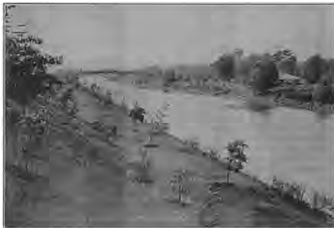
GENESEE VALLEY PARK

From 1923 to 1927 Rochester industries showed the greatest per cent. increase in the number of employees, stood second in the growth of wages paid, and rated third in the percent growth realized in manufacturing output, as compared with thirty leading American cities.