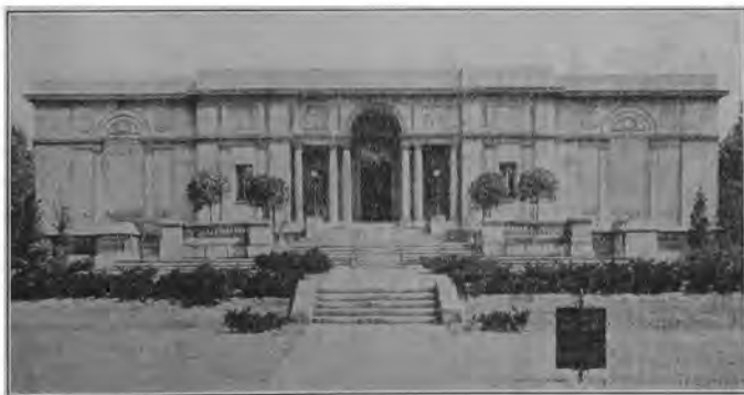
MEMORIAL ART GALLERY

In 1931, the Public Library Department spent approximately $343,144 for maintenance and upkeep.