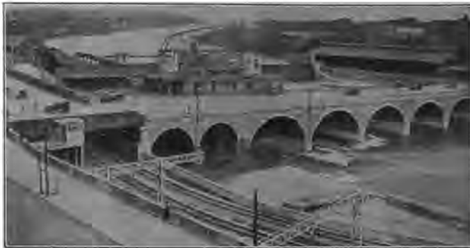
COURT STREET BRIDGE, SUBWAY AND BARGE CANAL HARBOR

In its new subway, Rochester has all the advantages of a highly modern joint transit railroad facility. This important traffic artery operated by electricity, provides expedited passenger and freight service for a large portion of the city, at a cost of more than $12,000,000. Rochester has utilized the right of way of the old Erie Canal, passing east and west through the very center of the city, which has been abandoned in favor of the New Barge Canal, south of the city.