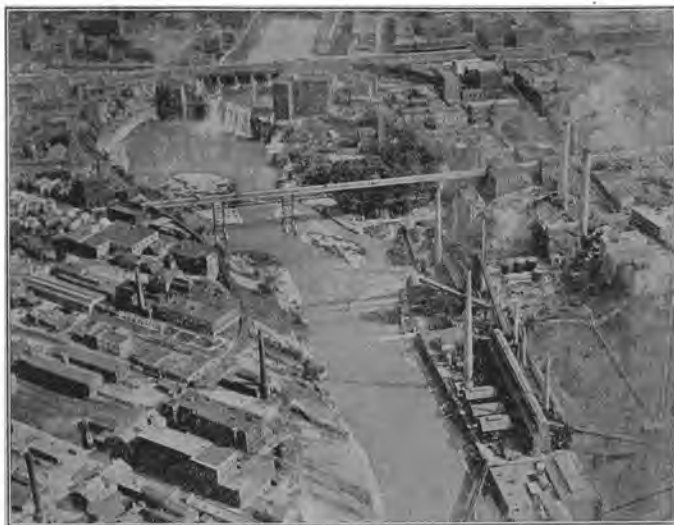
PART OF INDUSTRIAL ROCHESTER

Known first as the Flour City because of its extensive milling interests, the city's cognomen was later changed to the Flower City because of the extensive horticultural interests which were developed. With the growth of industry on a large scale, the city became known as the city of varied industries and took as its slogan "Rochester Made Means Quality." Rochester boasts many famous industrial organizations and leads the world in the production of a number of products.