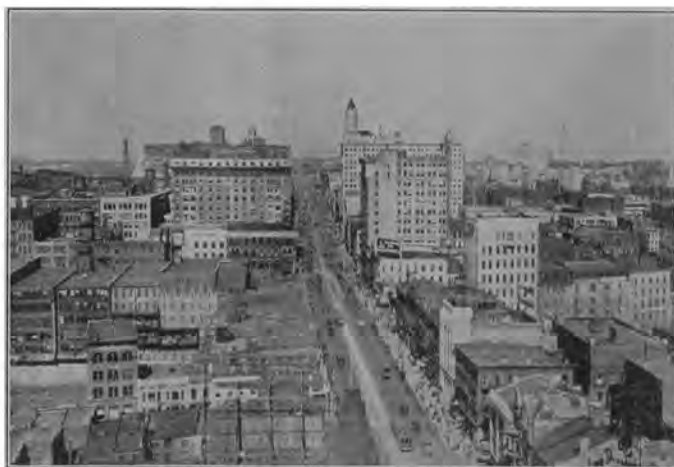
PART OF BUSINESS SECTION, LOOKING EAST ON MAIN STREET

filing devices and office systems; the largest thermometer plant in the world; the largest optical works in the world; the largest manufacturers of check protectors; the largest film factory in the world; the largest camera factory in the world; the largest photographic plate factory in the world; the largest manufacturers of soda fountain fruits and syrups. It is a leader in telephone apparatus, paper box manufacture and many other lines. More high-class ivory buttons are made here than in any city in the United States. It is the headquarters of the nursery business of the United States.