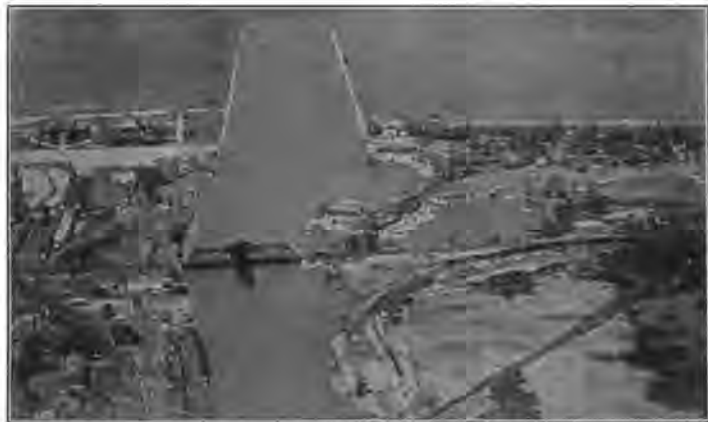
PORT OF ROCHESTER—ON LAKE ONTARIO

In the ninety-five years since its incorporation as a city in 1834, Rochester has enjoyed a remarkably uninterrupted growth. When the opening of the west resulted in the removal of the milling interests from the city, the enterprise of its citizens resulted in the establishment of other lines of industry.