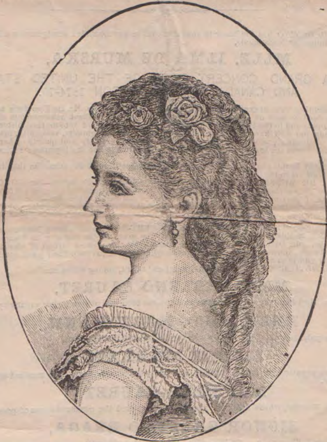
ILMA DE MURSKA, The Celebrated Hungarian Nightingale.