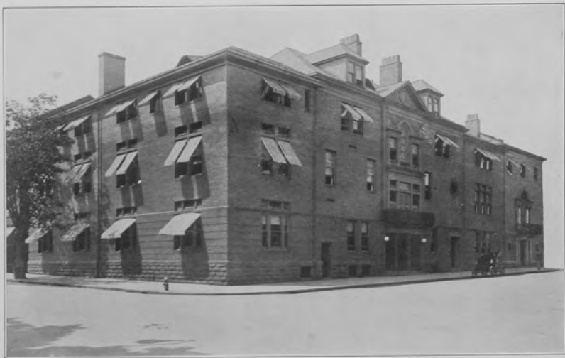
February 22d, 1889