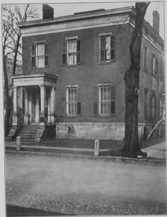
March 28th, 1885