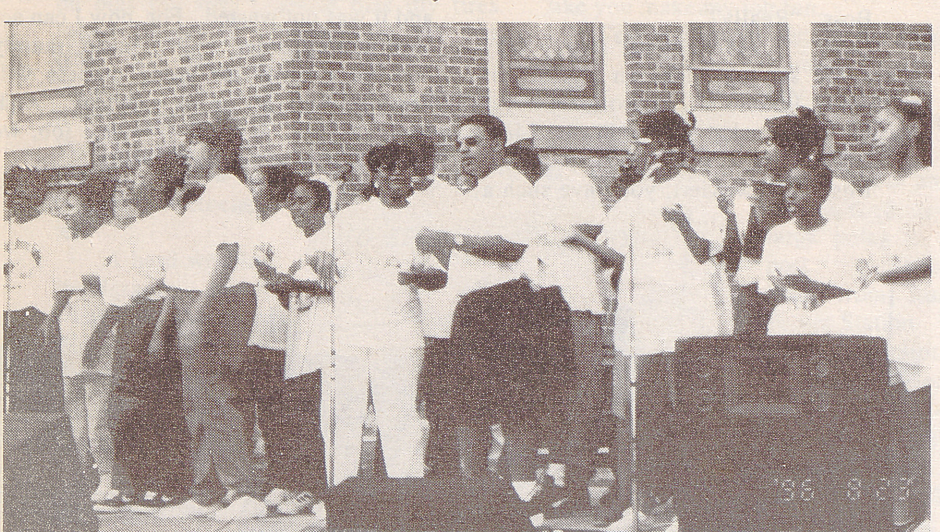
Immaculate Conception Gospel Choir and Kingdom Bound Kids perform together.

With these church and community events Grace Church/Grace Urban Ministries hope to continue to foster a spirit of peace and well-being in their neighbor-