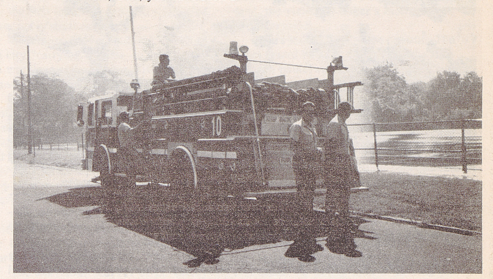
Firemen from the Dewey/Ridgeway fire station were not taking any chances this past Labor Day. As you can see, they were giving the fire hoses a thorough inspection to make sure the hoses labor properly.

It's a good thing I developed a sense of humor along my life's journey. Years ago, I felt a compassion for older people, and it was not wasted. For, now I can accept getting older with a smile; mainly because I know the aging process will catch up with all of us, someday. And, like it or not, with or without a job, we will all become venerable souls.