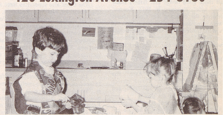
"Sharing & Caring for Over 100 Years"