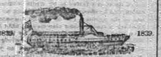
THE STEAMBOAT HAMILTON.