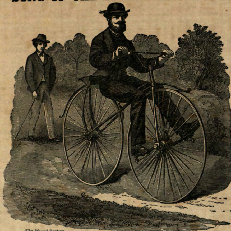
The Monod Pattern.