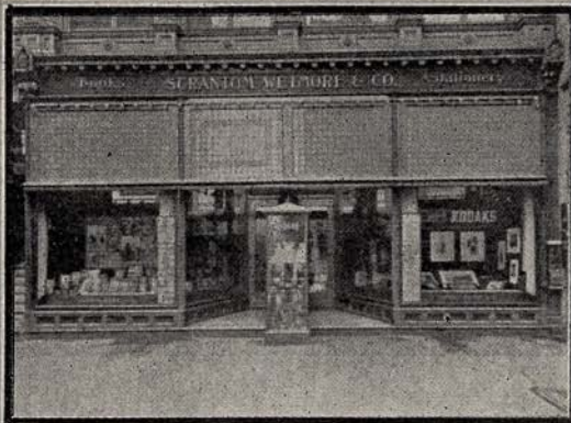
State Street Entran- ces