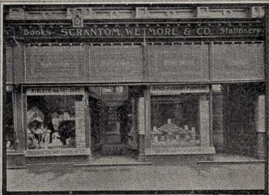
Main Street Entran- ces