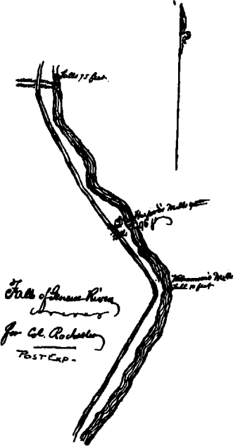
PORTAGE ALONG RIVER.

cleared of the trees; the stumps still remained; and the foliage of briars, grape vines and saplings to the clearing, was broken only by the narrow and thorny path to the mill. What a scene of desolation! An abandoned log house, the roof broken in, the door ajar, wild raspberries, shoots obstructing the en-