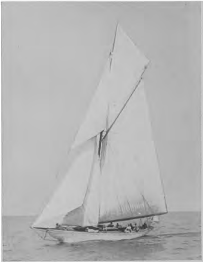
Yachting on Beautiful Lake Ontario

E VER hear of Lake Ontario? Belongs to Rochester. We let some other cities use it but it's our lake. Look at the yacht. Trolley lines, steam lines and automobiles will take you to the lake in less than half an hour. You can fish in it, sail on it, bathe in it, and look at it—you can't wear it out. Yes, there are any number of places where you can eat and be entertained."