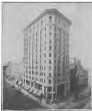
Chamber of Commerce Building

Niagara Falls, Watkins' Glen and many Canadian points are easily accessible and the journey occupies but a short time so that they can be included in your convention itinerary.