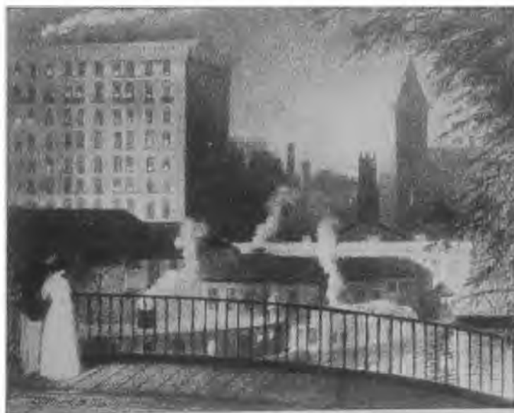
The Old Erie Canal at Dusk