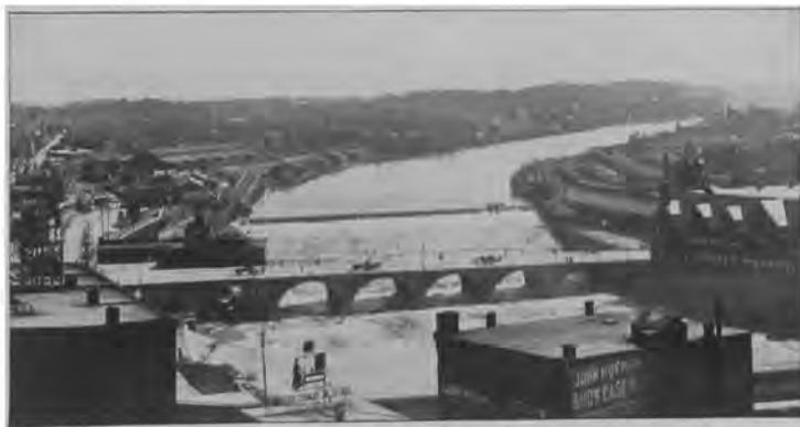
Genesee River, Looking South from C. of C. Building