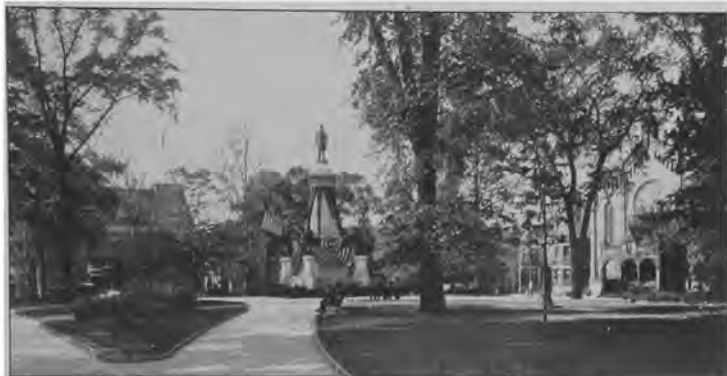
Soldiers' Monument—Washington Square

in Rochester, they won't mention it while you are there. There's no excuse for not coming. What do you say?"