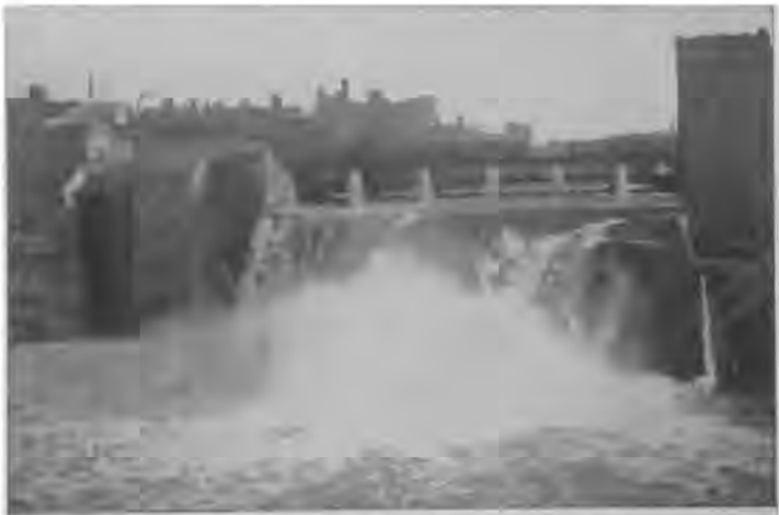
Upper Falls of the Genesee River

Largest manufactory of photographic supplies and apparatus in the world.