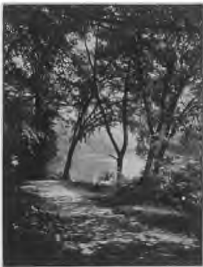
Indian Trail, Maplewood Park

cities. A forty acre tract in the middle of the city, with gates and fences, grass plots, nine fire-proof buildings, 100,000 square feet of floor space in three main exposition buildings, completely wired, illuminated and ventilated, band stand, large auditorium with out-door peristyle, we feel that it is the finest place ever offered to any convention. With such a background and equipment, exhibits are given