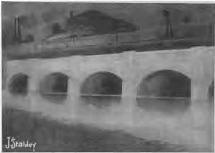
Central Avenue Bridge at Night