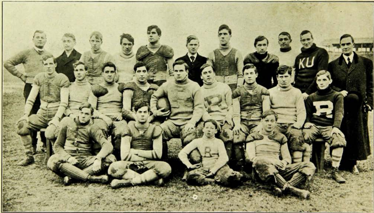
THE TEAM OF 1905