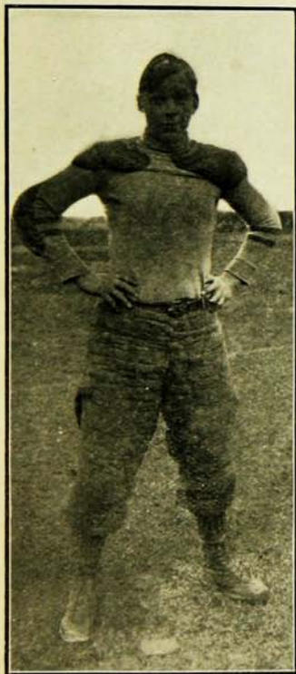
CARL SMITH Center