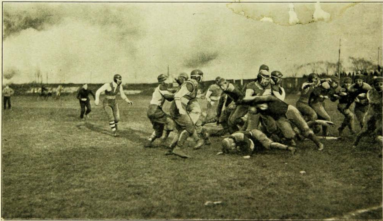
A SCRIMMAGE IN THE ITHACA GAME