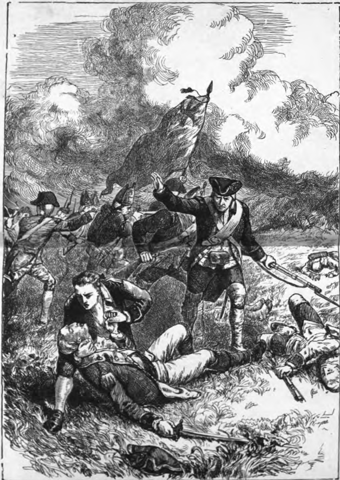
DEATH OF GENERAL ROSS. Page 266.