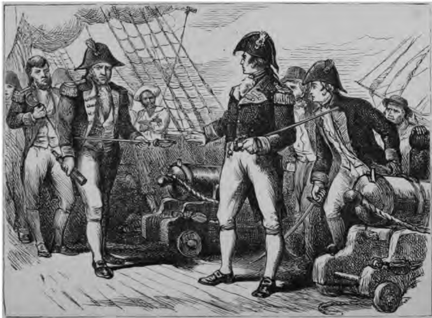
THE SURRENDER OF THE PEACOCK.