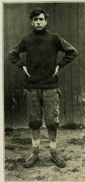
Sam Grant Center