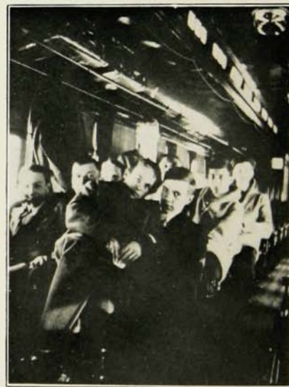
BOUND FOR VICTORY