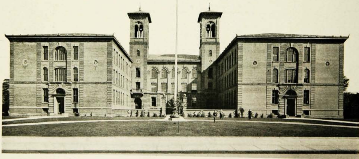
EAST HIGH SCHOOL