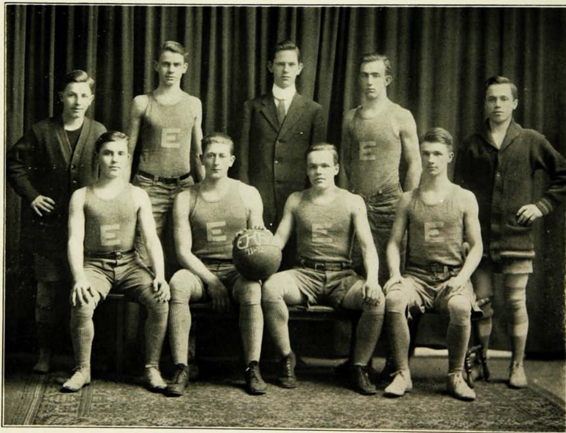
THE SECOND TEAM