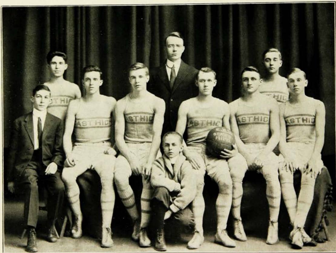
EAST HIGH BASKETBALL TEAM