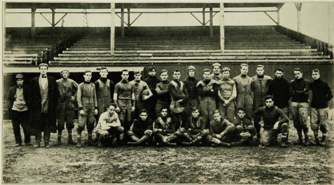
EAST HIGH SQUAD