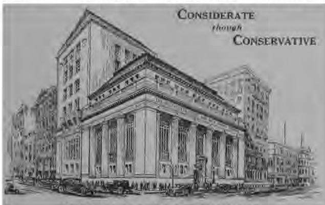
MAIN STREET WEST AND EXCHANGE

Rochester's First Trust Company—Operating under Perpetual Charter