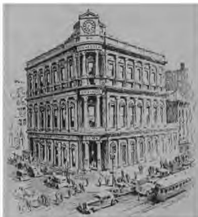
West Main Street Office 47 WEST MAIN ST.

Resources over - $68,000,000 More than 100,000 Depositors