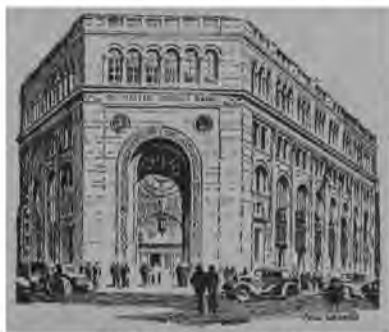
Franklin Street Office 40 FRANKLIN STREET